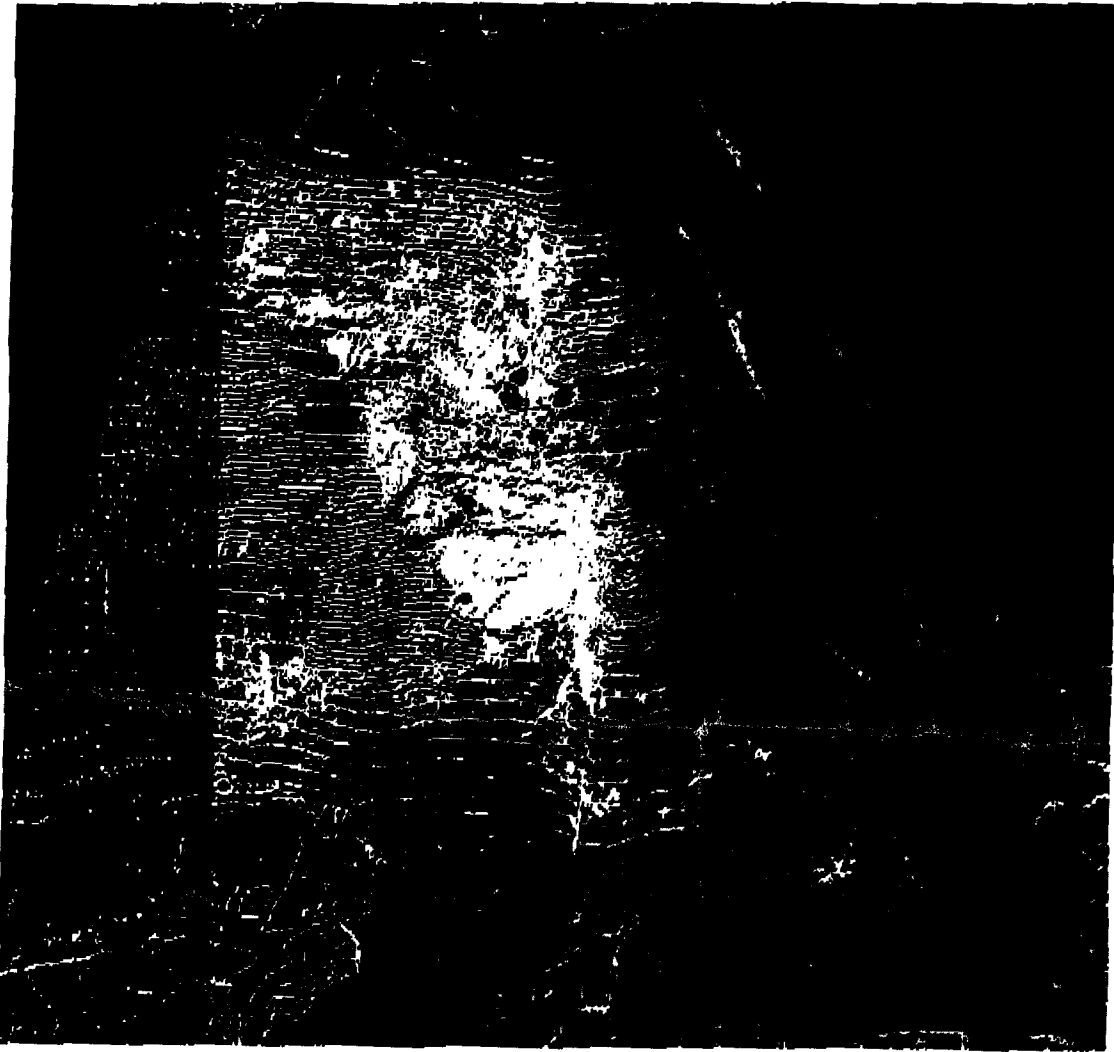
Figure 2. Survey data placed over aerial scene photo to orient known point of departure with survey data.

301 SW 4 TH STREET SUITE 160 CORVALLIS, OR 97333 541-754-9645 • FAX 541-754-9949