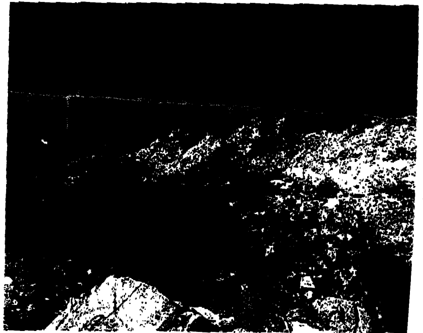
Figure 1a) The cliff face viewed from below; 1b) The inlet where Lauren was reported to have been found